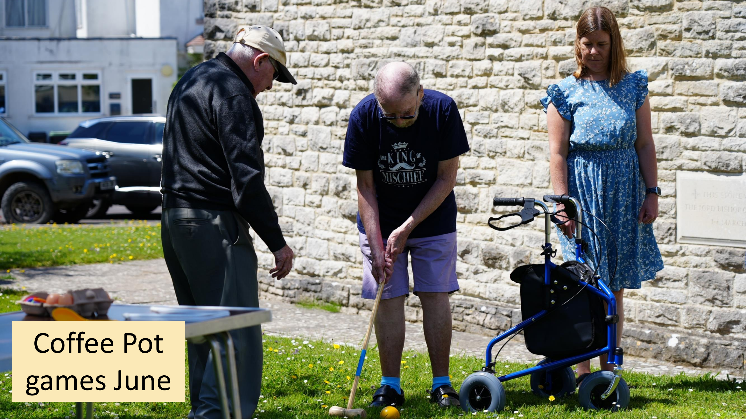
Coffee Pot games June