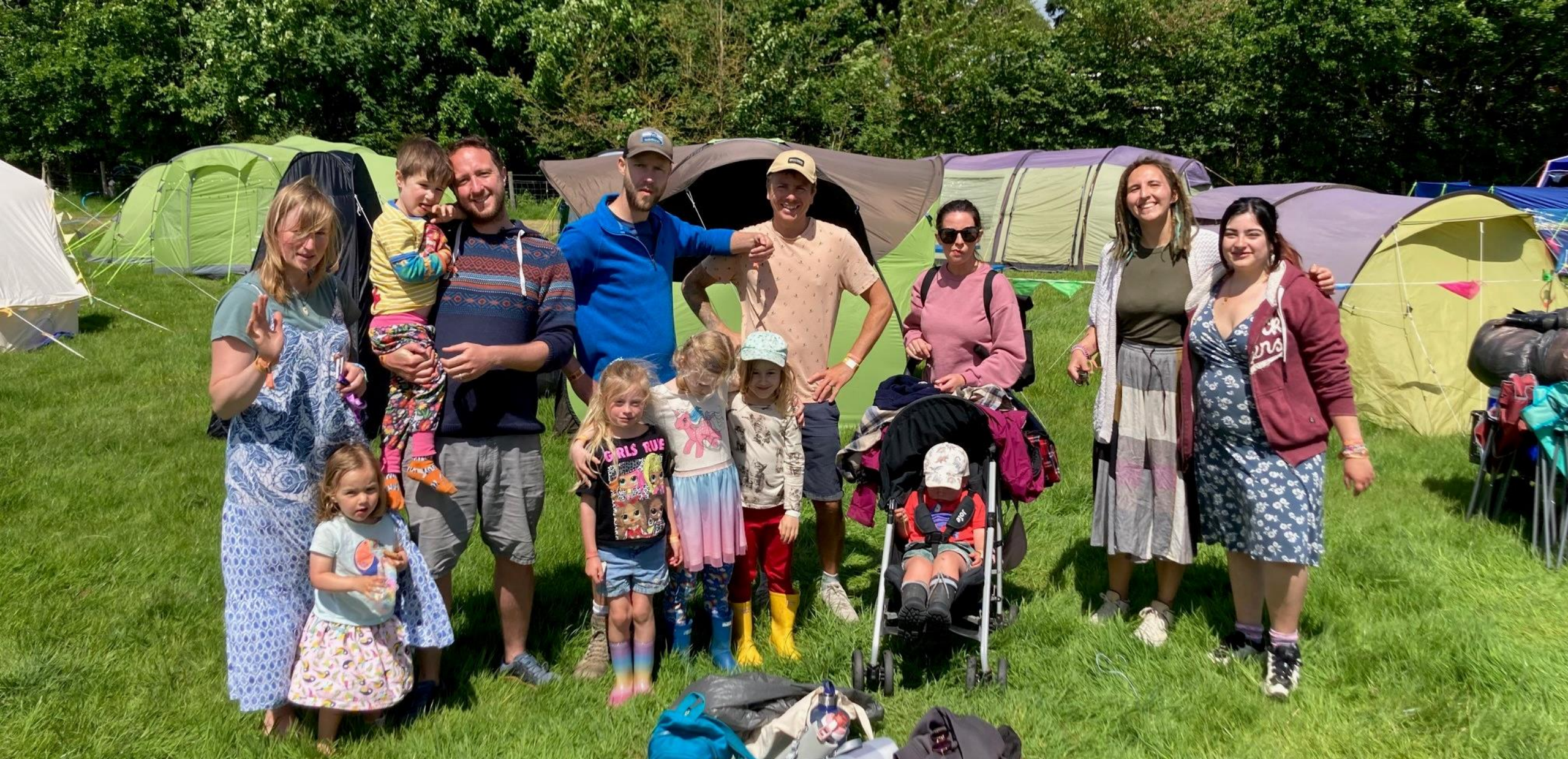
The Big Church Festival in May