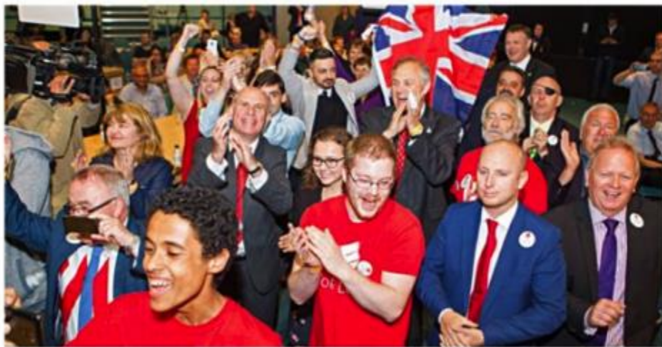
Jubilation: The many faces of Vote Leave supporters as they celebrate their momentous victory in Peterborough early yesterday

It was the day the quiet people of Britain rose up against an arrogant, out-of-touch political class and a contemptuous Brussels elite. Read the Mail's incomparable writers on the most tumultuous event of our times