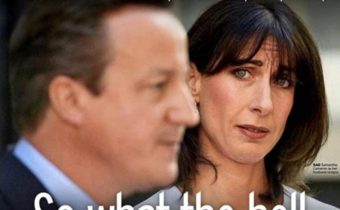
SAM Samantha Cameron as her husband resigns

» Find out what leaving Europe actually means for you and your family