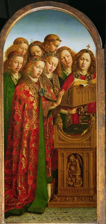
DEO LAUS PRIBUS - ORAN - A - O