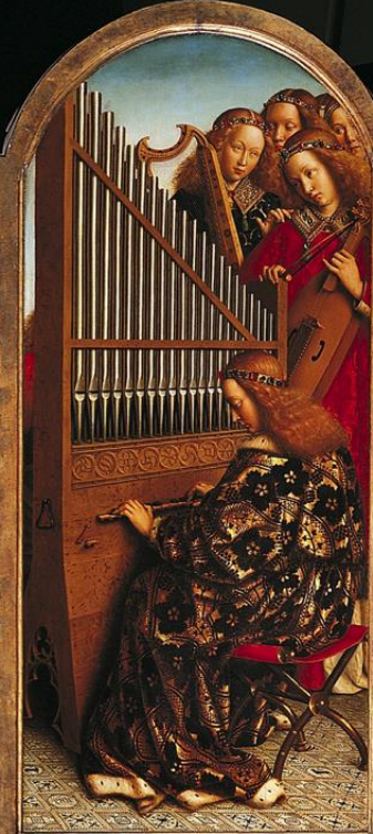
PRIBVIT SV AN - CORDIS ET - OROVAVO

HIC EST BAPTISTA XPIES MAIOR HOIC DATI ANGELI LOCIS SVTOR SVBROBIL SVTO AVT SVT SVT SVT SVT