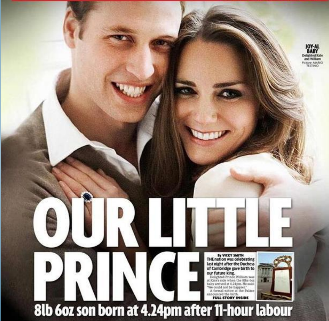
JOY-AL BABY Delighted Kate and William

SOUVENIR EDITION PLUS ROYAL BABY PULLOUT